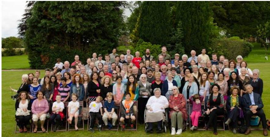
Scottish Summer School 2012